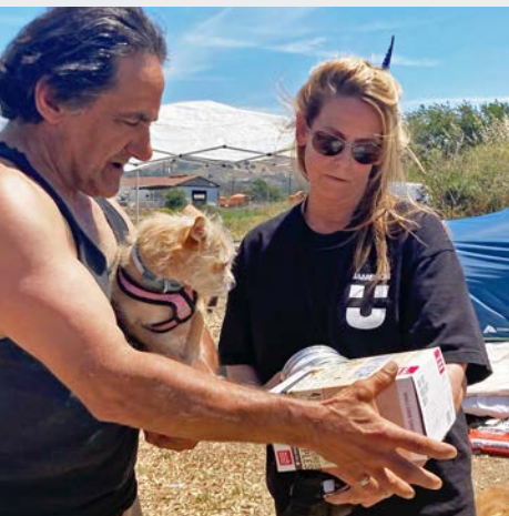
The Jameson Mobile Vet providing affordable spay/neuter services

During the pandemic, there was a severe shortage in the availability of veterinary care, and people and their animals have been suffering. The population of strays and surrenders has boomed, leading to overpopulation, distress, and death. We must address this, and quickly. Our Vet Mobile provides access to affordable animal care—primarily spay/neuter services— to those who are most in need. We have been working diligently to get our Vet Mobile on the road to serve as many people and their animals as possible. With your help, we can make these life-saving services available to many, many more!