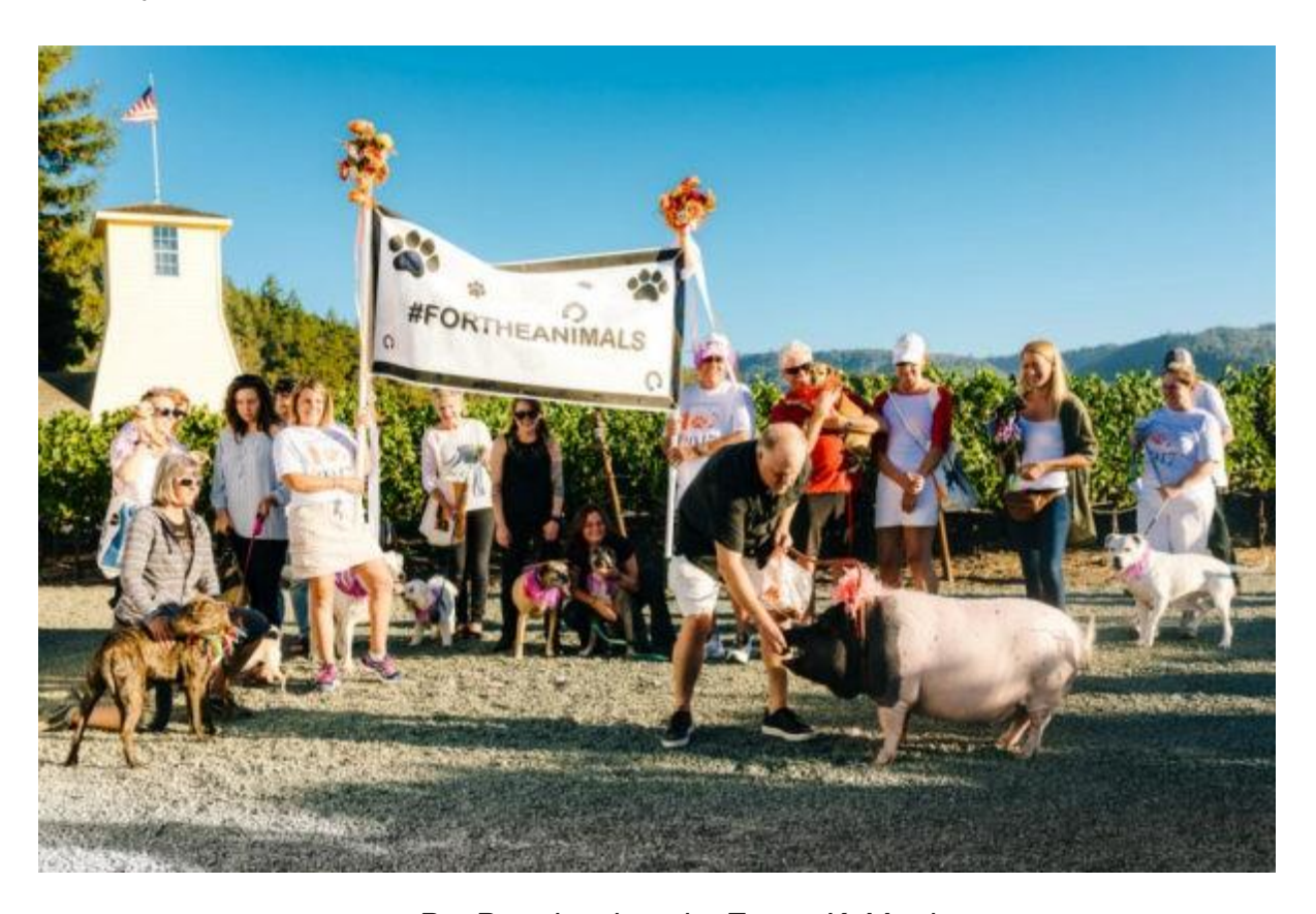
Pet Parade

Napa, CA – Jameson Animal Rescue Ranch (JARR), a world-class animal rescue organization that exemplifies the values of quality, commitment, and generosity of the Napa Valley, raised $1.3 million at its annual wine auction and charitable event, WineaPAWlooza. Held at the Gamble Family Vineyards located in the stunning Napa Valley, the July 29th event far exceeded expectations as acclaimed vintners, and visitors from around the United States teamed up for the cause.