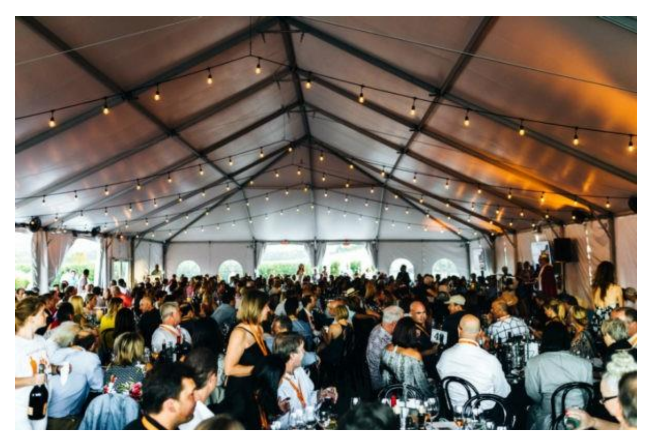
Auction Tent

The evening included a two-hour grand tasting of the most sought after wines in the valley, a star-studded pet parade, decadent plant-based food offerings and a high-energy live auction led by notable wine auctioneer, Fritz Hatton. The spectacular auction lots were all about luxury and lifestyle and included some of the most unique and sought after wines and wine experiences available in the country.