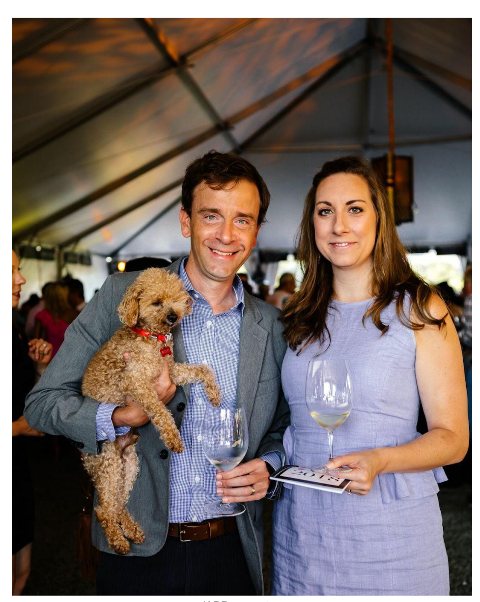
JARR supporters

Animal-loving wine drinkers were out in full force last weekend at the <u>fifth annual</u> Wineapawlooza event in <u>Napa</u>. The gala fundraiser was put on by the wine country-based charity <u>Jameson Animal Rescue Ranch</u> (JARR), a state of the art animal rescue facility